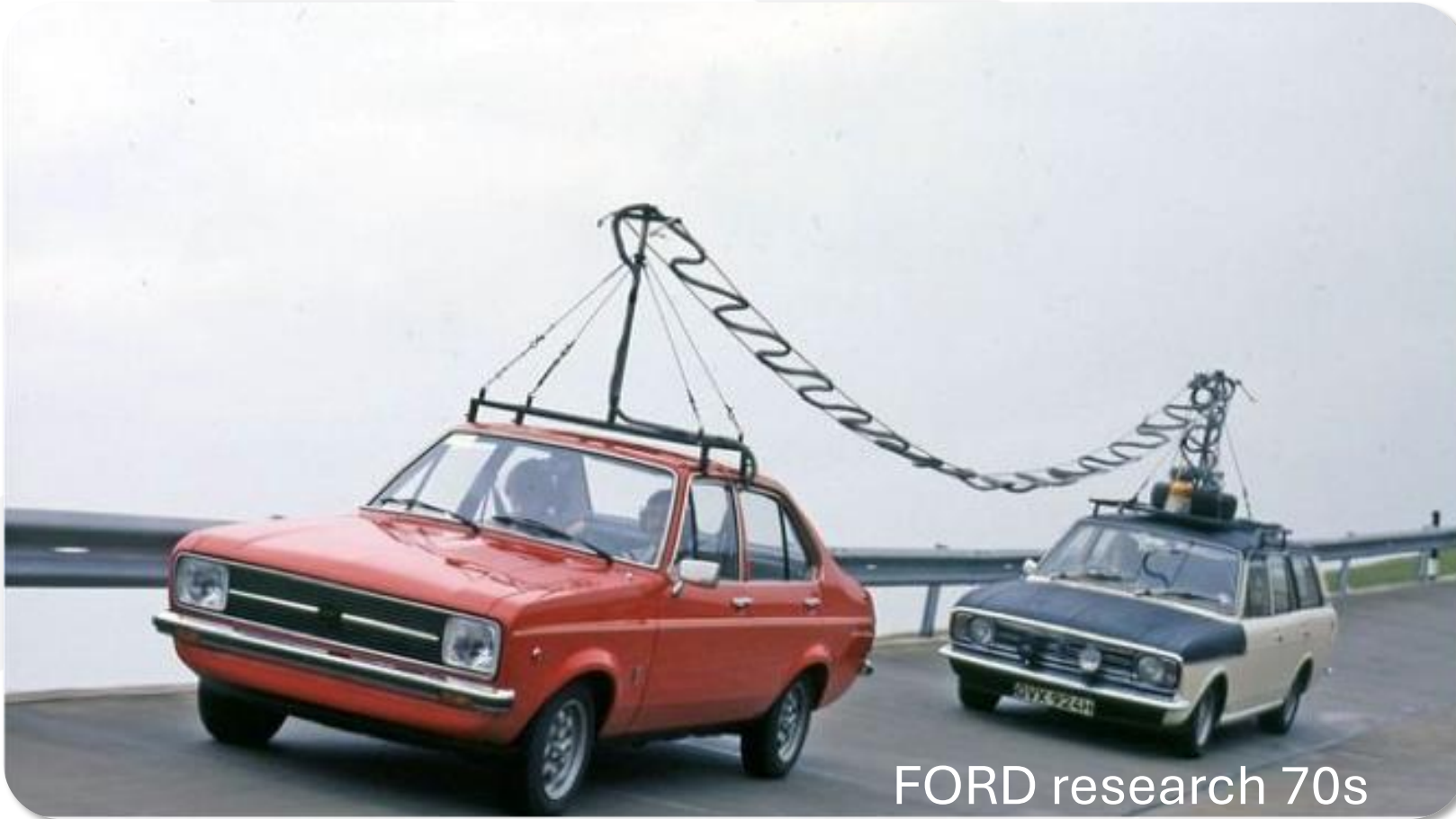
FORD research 70s

“roadside assistance” for CAVs, connectivity is key