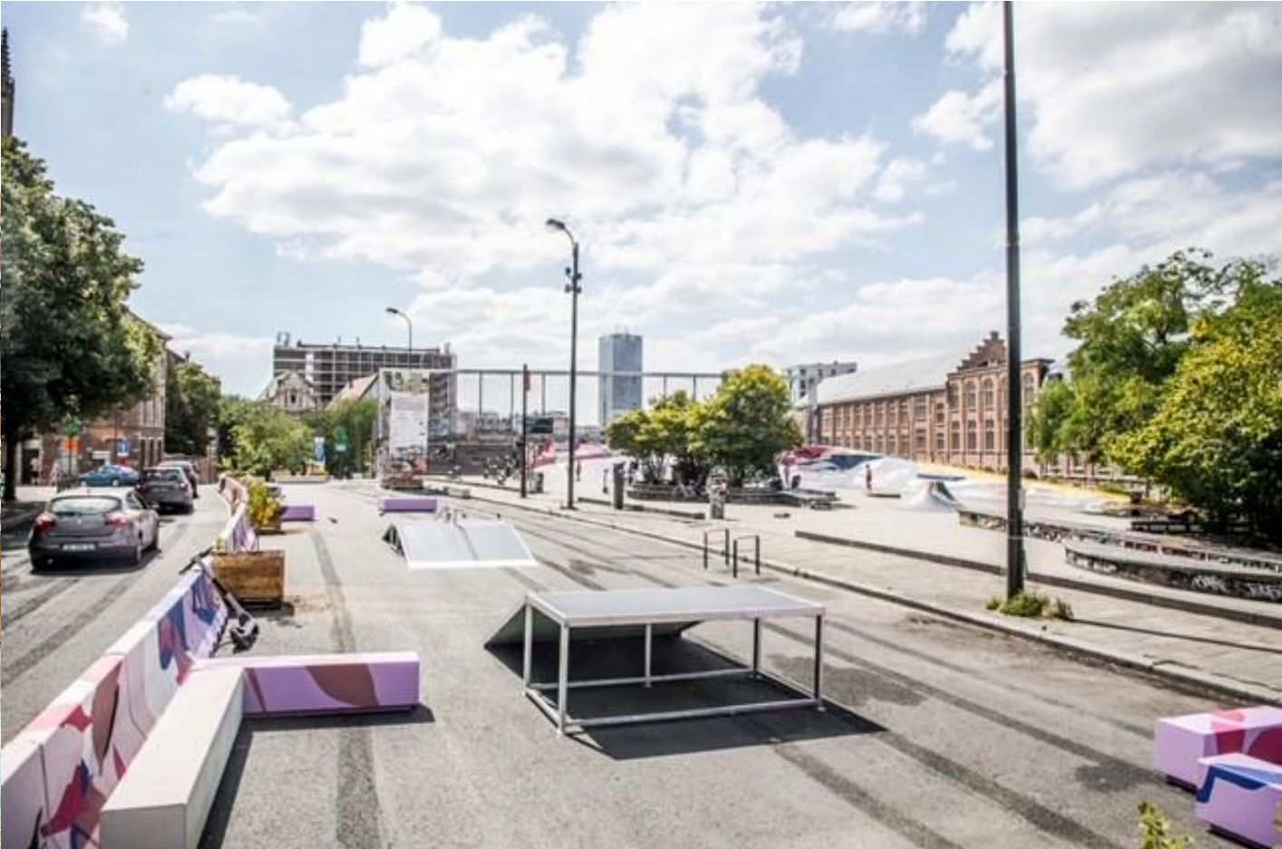
Skatepark - Chapelle