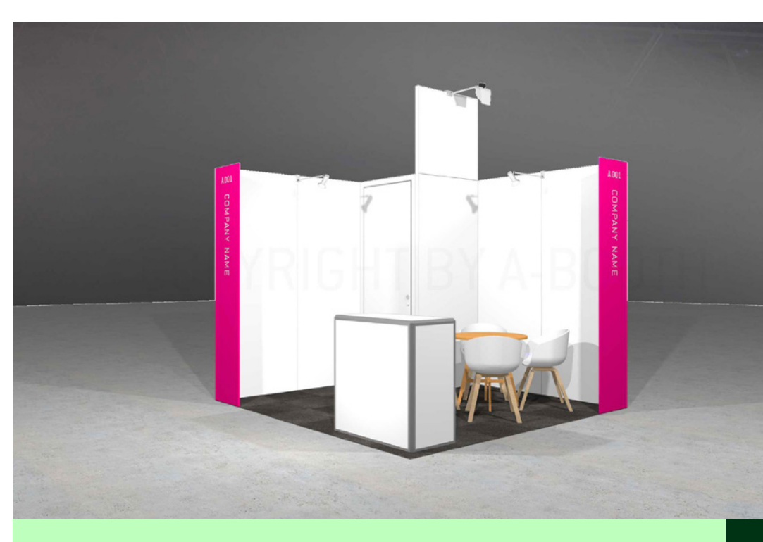
CORNER STAND (NO VISUAL INCLUDED) 9m<sup>2</sup> and up