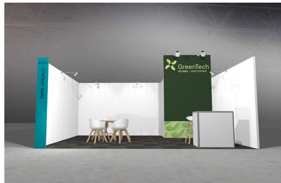
WALL STAND 12m 2 and up