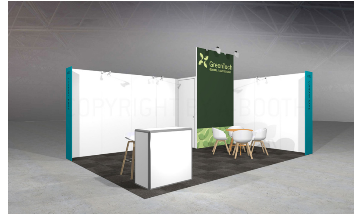
CORNER STAND 12m 2 and up