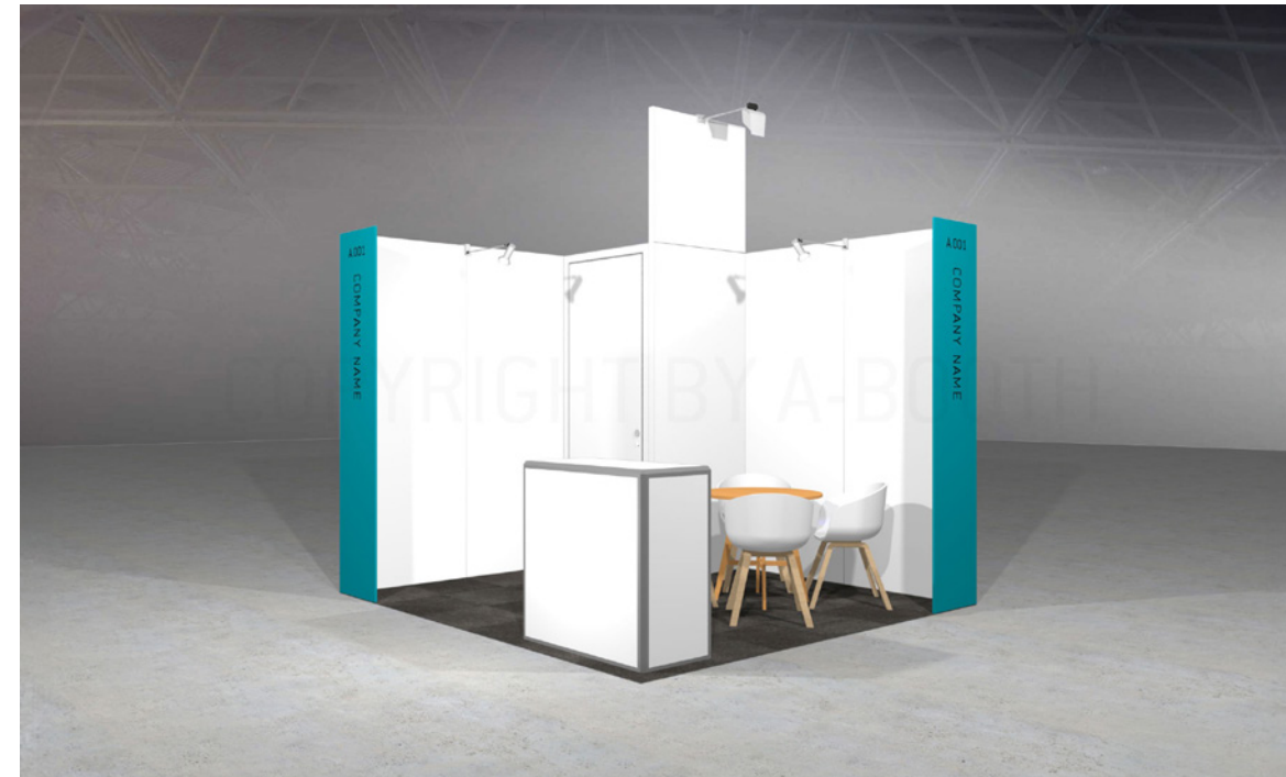
CORNER STAND (NO VISUAL INCLUDED) 9m 2 and up