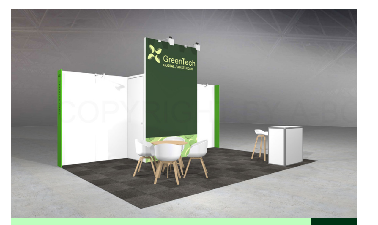
FRONT STAND 12m<sup>2</sup> and up