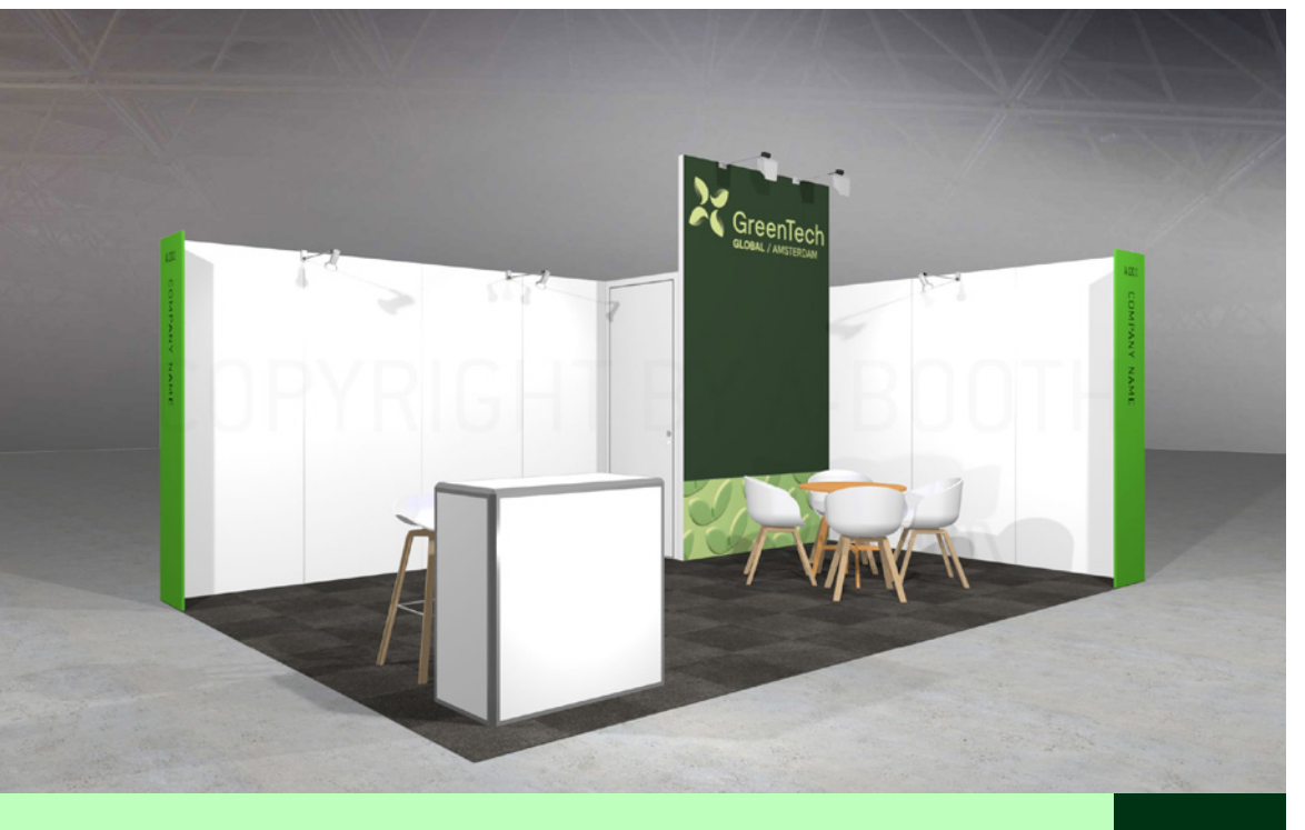
CORNER STAND 12m<sup>2</sup> and up

Please note: the location of lockable storage is the same as in picture and the attached visuals are a general example.