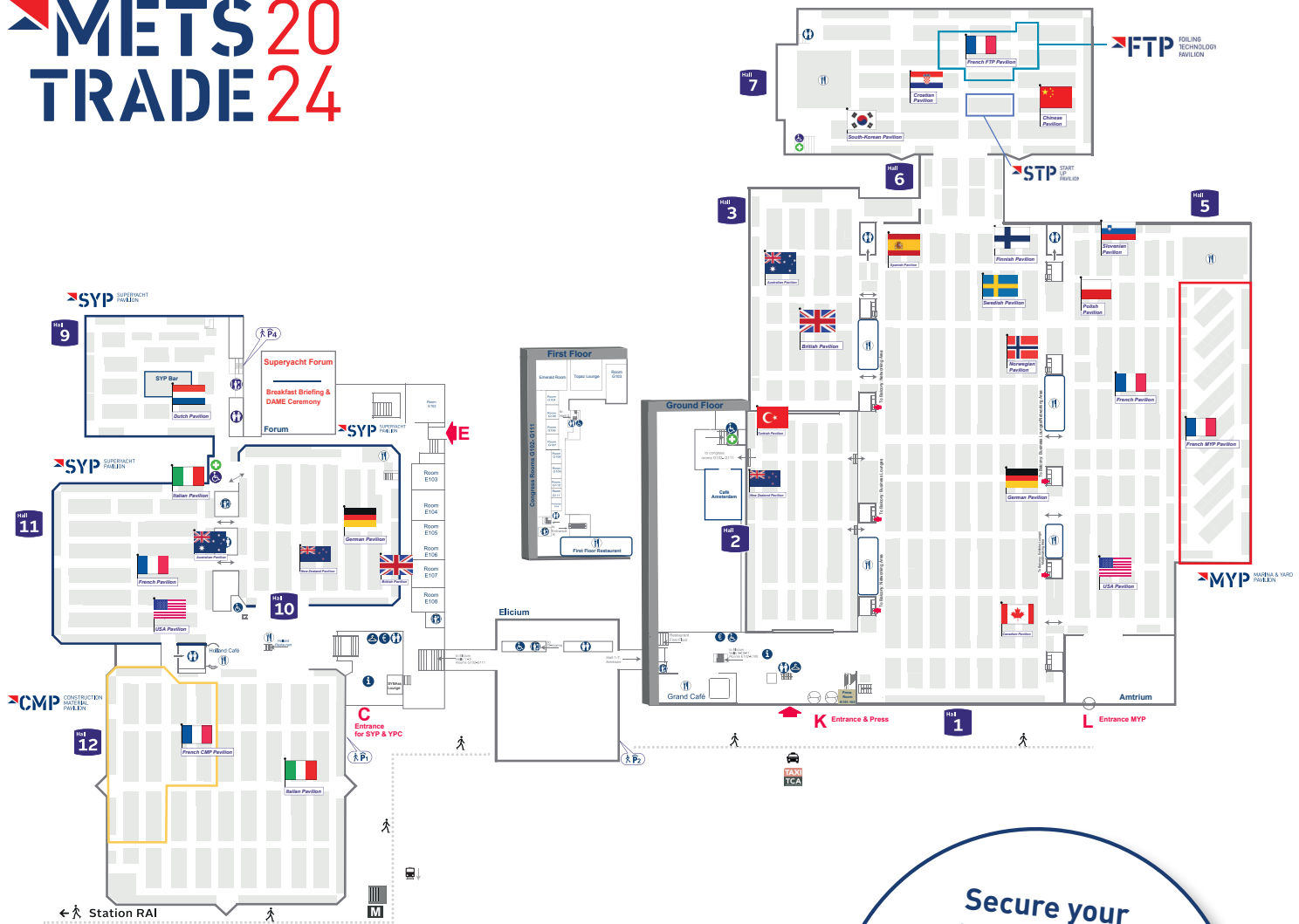
Provisional floor plan METSTRADE 2024. Subject to change.

Secure your METSTRADE success & rebook today. Benefit from the Early Bird Rate and Preferred Allocation!